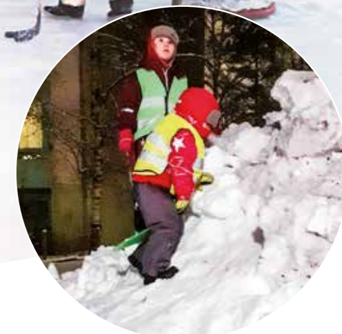
Children are playing in the snow on Ylioppilaankatu.