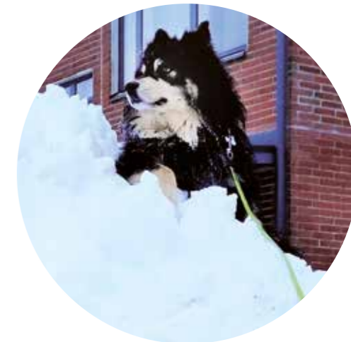
Ropi the dog sends snowy greetings from Linnoituksenkatu.