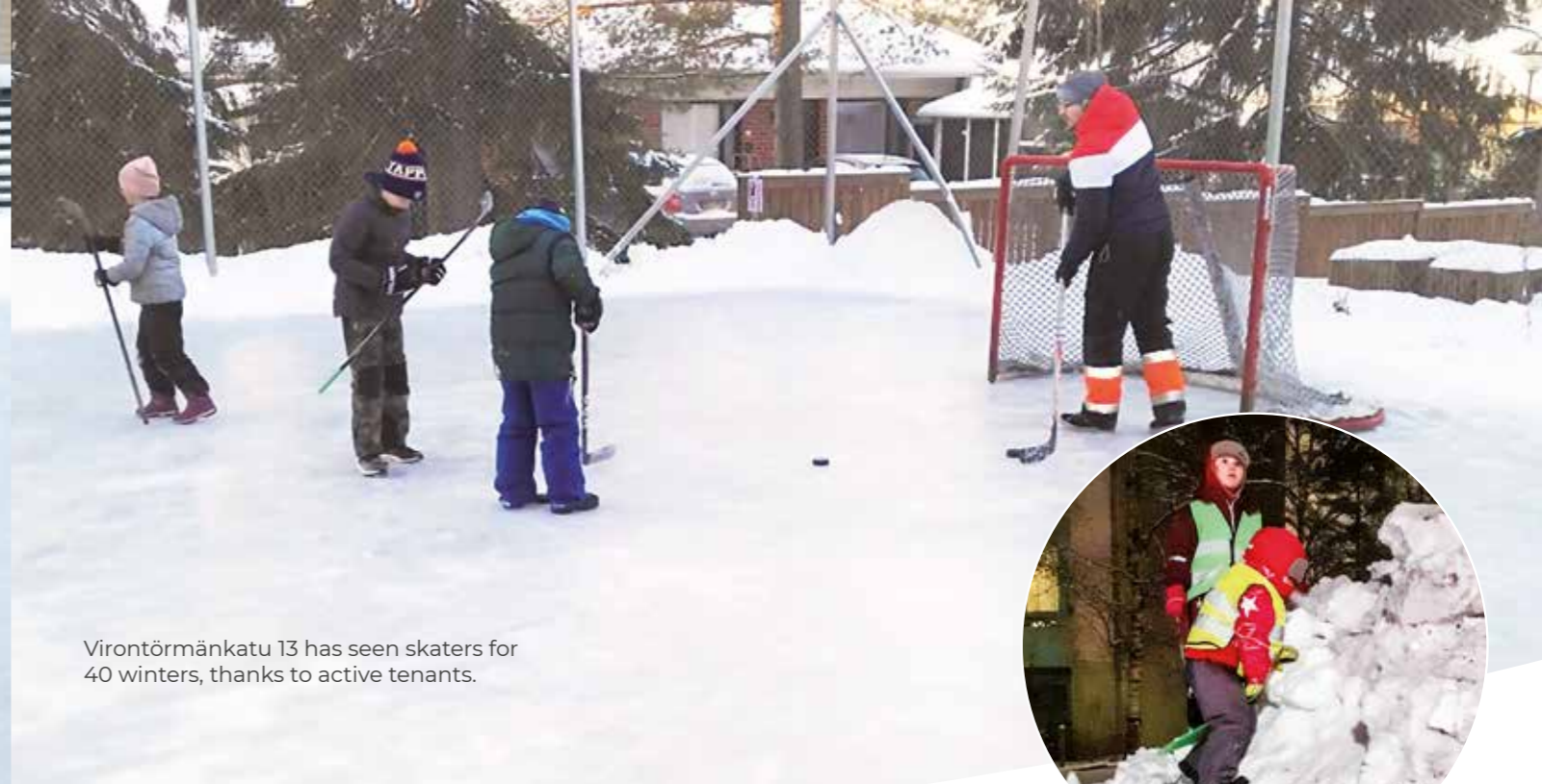
Virontörmänkatu 13 has seen skaters for 40 winters, thanks to active tenants.